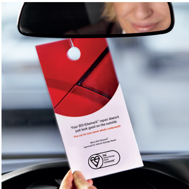
BSI Kitemark Scheme for Vehicle Damage Repair