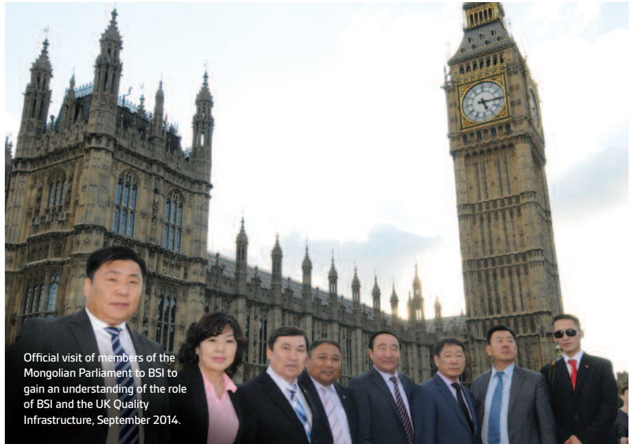
Official visit of members of the Mongolian Parliament to BSI to gain an understanding of the role of BSI and the UK Quality Infrastructure, September 2014.

The project raised international awareness of EGAC and enhanced its capacity. Egypt is now a signatory to ILAC and IAF and is part of an EA cooperation agreement under regional accreditation body Arab Accreditation.