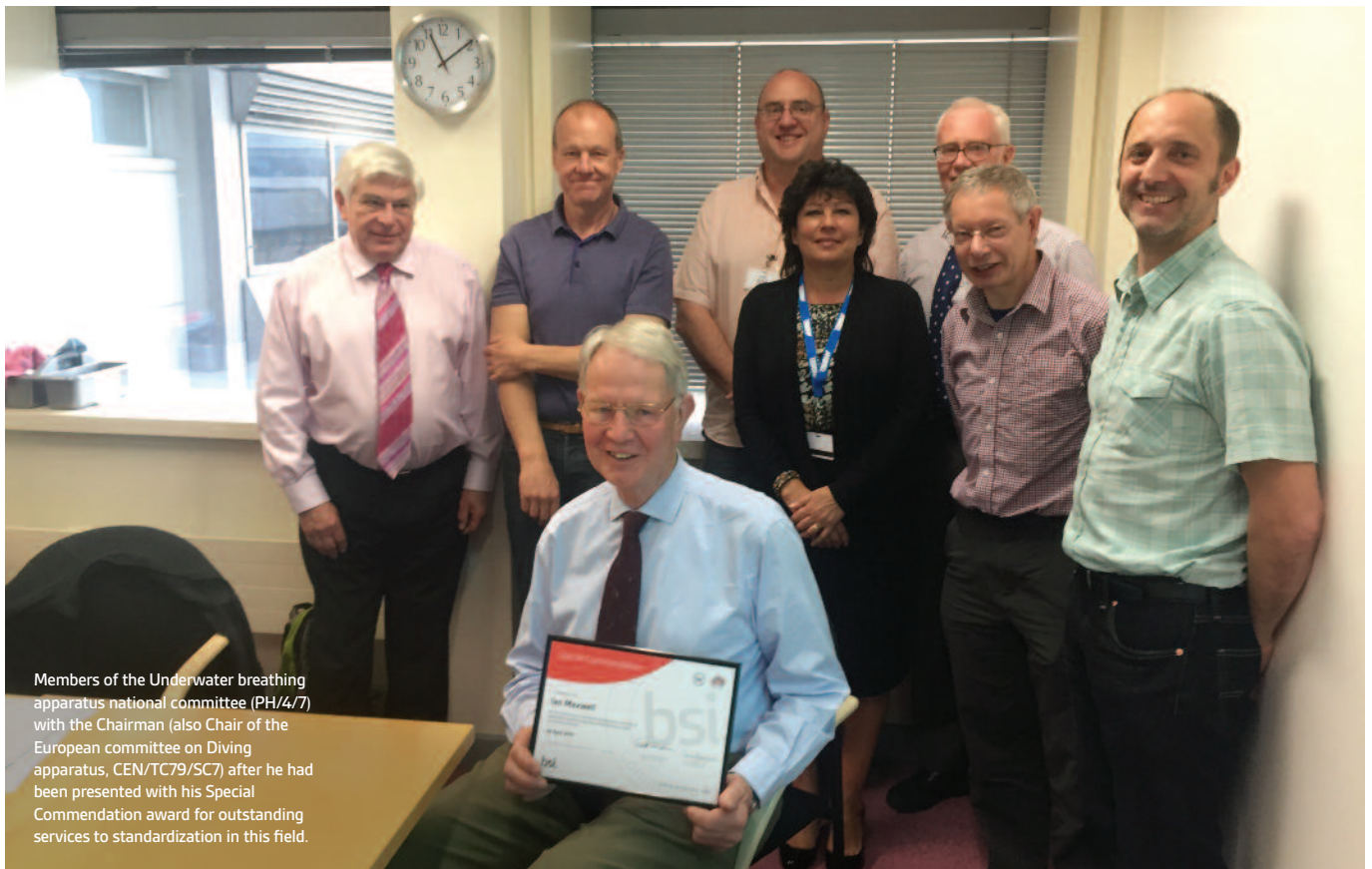
Members of the Underwater breathing apparatus national committee (PH/4/7) with the Chairman (also Chair of the European committee on Diving apparatus, CEN/TC9/SC7) after he had been presented with his Special Commendation award for outstanding services to standardization in this field.