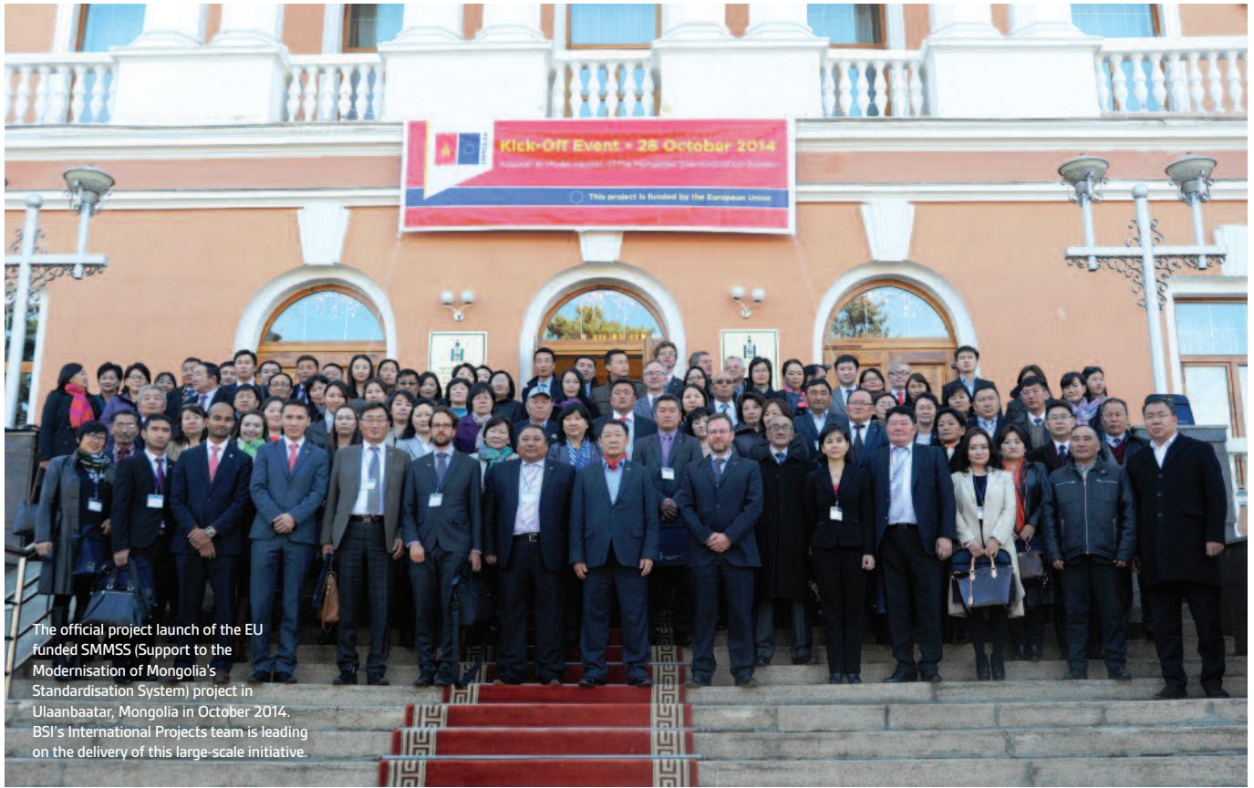
The official project launch of the EU funded SMMSS (Support to the Modernisation of Mongolia's Standardisation System) project in Ulaanbaatar, Mongolia in October 2014. BSI's International Projects team is leading on the delivery of this large-scale initiative.

We hosted the latest round of the EU-US task force meetings in London to discuss increased cooperation in the making and use of standards in support of transatlantic trade.