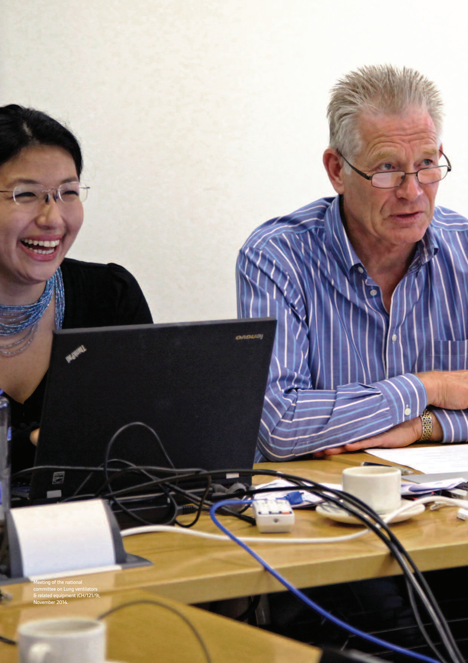
Meeting of the national committee on Lung ventilators & related equipment (CH/121/9), November 2014.