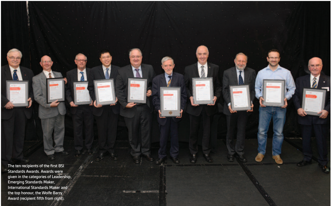
The ten recipients of the first BSI Standards Awards. Awards were given in the categories of Leadership, Emerging Standards Maker, International Standards Maker and the top honour, the Wolfe Barry Award (recipient fifth from right).

In 2013 we started working on four Innovate UK pilot studies concerning offshore renewable energy, synthetic biology, cell therapy and assisted living. These projects have been completed. We researched the role standardization could play in the rapidly developing sphere of offshore renewable energy (e.g. wind, tidal and wave power), and worked with SynBiCite, the Imperial College-led Innovation and Knowledge Centre in synthetic biology, to develop a standards strategy to help accelerate development of synthetic biology. We also worked with the Cell Therapy Catapult, a London-based centre of excellence for regenerative medicine (established by Innovate UK in 2012), to build the UK's position as a global leader in cell therapy. David Willetts, former Minister for Universities and Science, identified synthetic biology and cell therapies/regenerative medicine as one of the "Eight Great Technologies" the UK should prioritize.