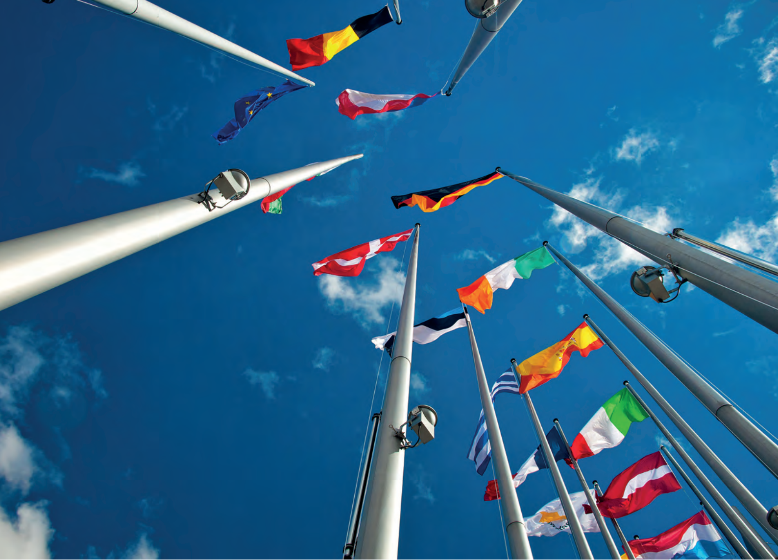
Flags of the member states of the EU