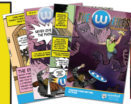
COMIC BOOK AND POSTERS

HELP KEEP TOPICS BEYOND THE PHISH TOP OF MIND FOR YOUR END USERS WITH OUR NEW COMIC BOOK-THEMED AWARENESS VIDEO CAMPAIGNS, "THE W FILES: #BEYONDTHEPHISH".