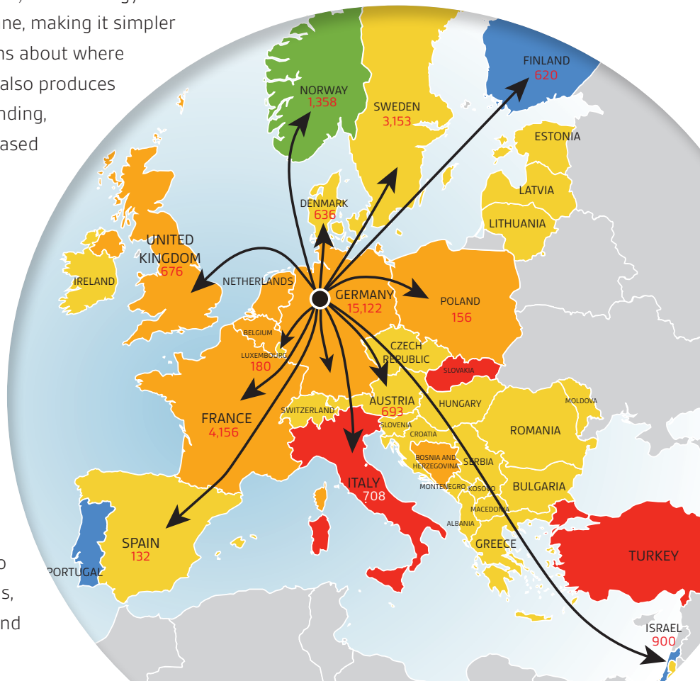
Cargo Theft Risk and Product Distribution Volumes

Loss forecasting, combined with mapping key risk exposures, helps organizations build resiliency and quantify the risks of moving into new markets. Instead of reacting to disruptions, security organizations proactively anticipate and prevent losses. Accurately assessing risk and quantifying the cost-benefit of security measures demonstrates the value and return on investment to organizational leadership, and is crucial to avoiding expensive losses that prevent you from serving your customers.