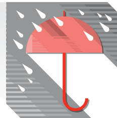
Increased liability insurance premiums