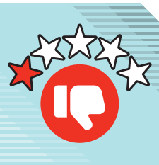
Damage to reputation and good-standing