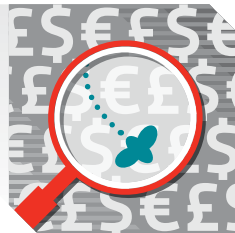
Costs and duties imposed by incident investigations