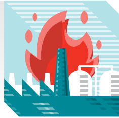
Plant closure due to large-scale events such as fire