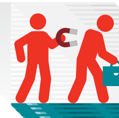
Recruitment and retention challenges