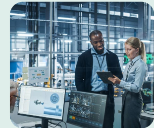
Transport & mobility